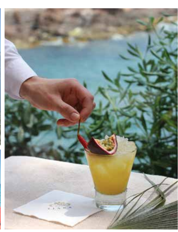
A FESTIVE EVENING Sunset drinks in our gardens