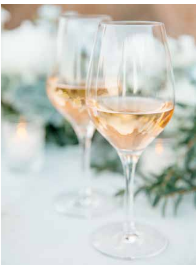
Your welcome reception in our blooming gardens