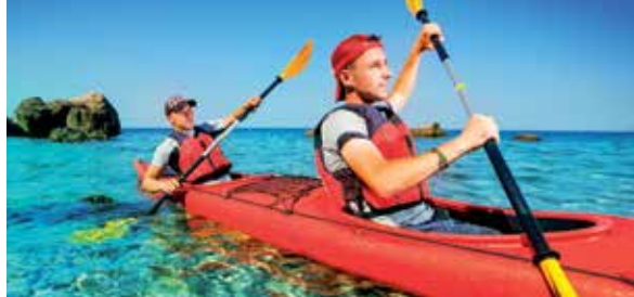
A SPORTY AFTERNOON A 180 minutes race made of 4 challenges