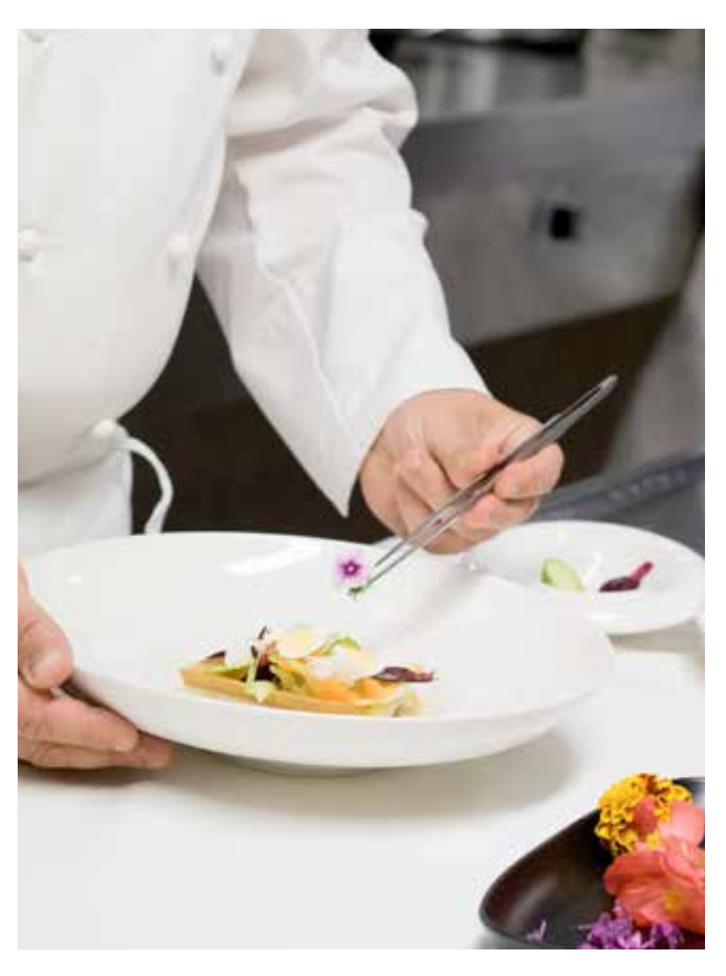
Our chef is at your service to customize the menu to your taste