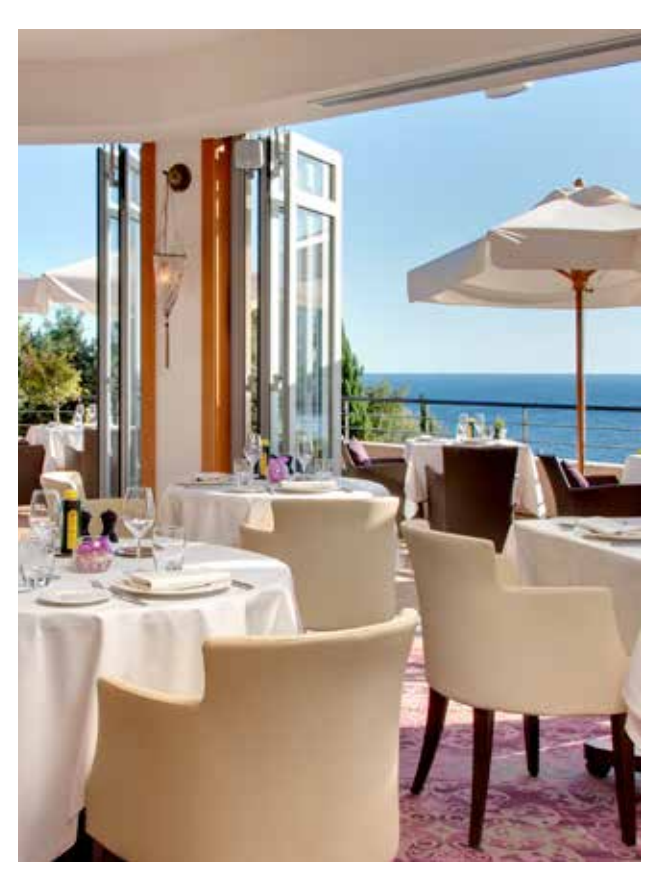
A magical wedding in an exclusive place