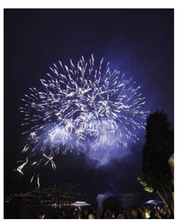
Gastronomic cuisine, floral decoration Party: DJ, jazz band, artists performances Wedding ceremony facing the sea